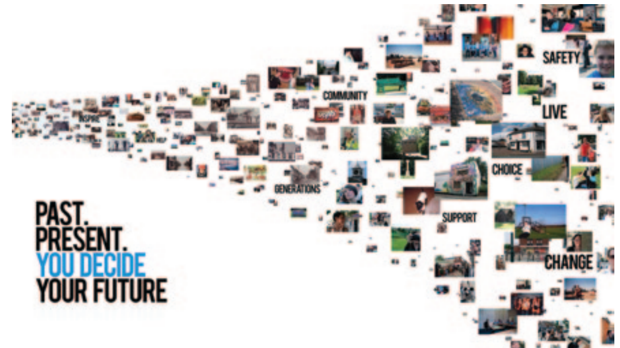
Art work from young people at Burntwood Positive Futures for their local police station.