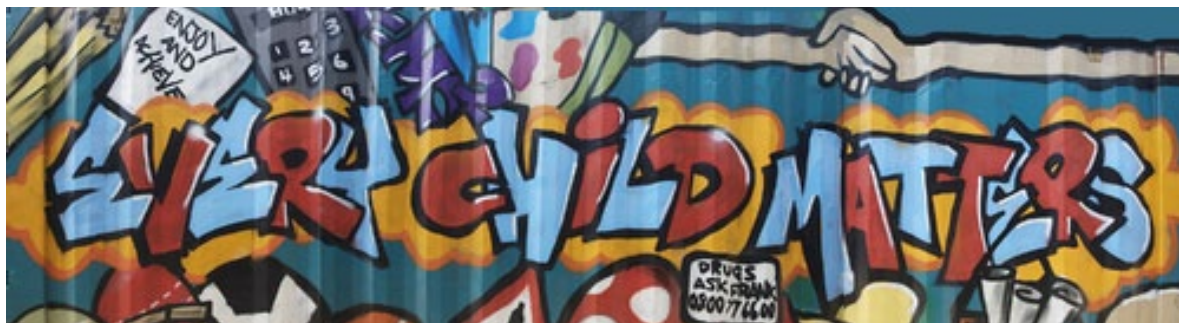
Art work from young people at darts (Doncaster Community Arts) Positive Futures.

The Positive Futures Youth Advisory Board was set up to put young people at the heart of the programme and give them a positive voice in policy and in their community. The board consists of 23 young participants, known as young advisors, drawn from all parts of the country. Each person helps to shape the future direction of the programme by highlighting issues and concerns that affect both the young people in their project and themselves directly.